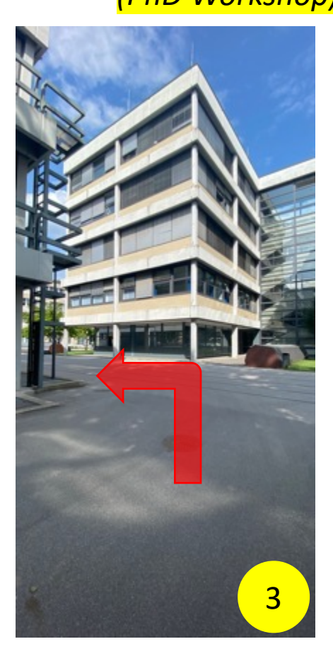
Turn left at that crossroad (when you see this building)