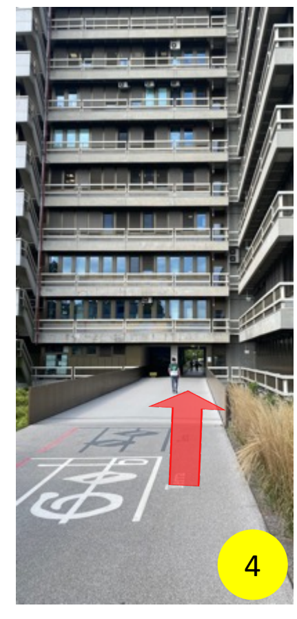
Continue straight ahead until you are directly underneath this big building (=TNF-Turm). Do NOT go through... (see next page)