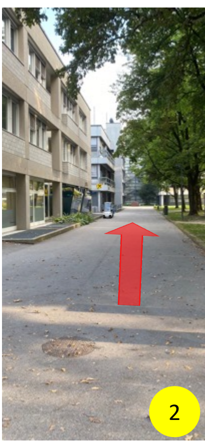
Continue on this road until you reach a crossroad at the end...